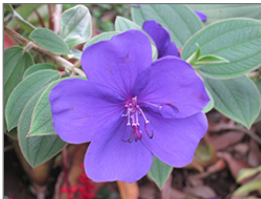
Princess Flower flowers