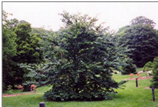
American Beech