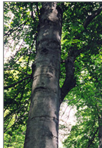
American Beech bark

This tree should only be grown in full sunlight. It requires an evenly moist well-drained soil for optimal growth, but will die in standing water. It is not particular as to soil pH, but grows best in rich soils. It is quite intolerant of urban pollution, therefore inner city or urban streetside plantings are best avoided, and will benefit from being planted in a relatively sheltered location. This species is native to parts of North America.