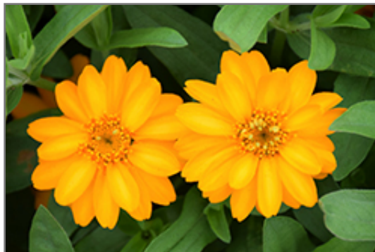
Profusion Double Golden Zinnia flowers