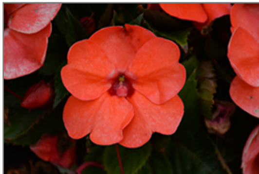
SunPatiens Compact Hot Coral New Guinea Impatiens flowers

SunPatiens Compact Hot Coral New Guinea Impatiens is recommended for the following landscape applications;