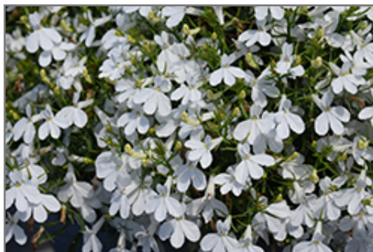
Techno Upright White Lobelia flowers

Techno Upright White Lobelia is recommended for the following landscape applications;