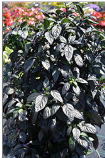
Black Pearl Ornamental Pepper