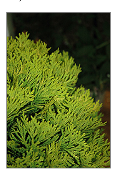
Anna's Magic Ball Arborvitae foliage

Anna's Magic Ball Arborvitae is recommended for the following landscape applications;