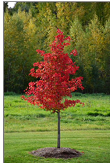
Wildfire Black Gum in fall