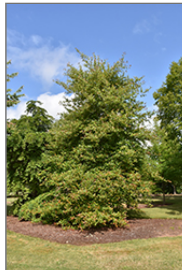
Wildfire Black Gum