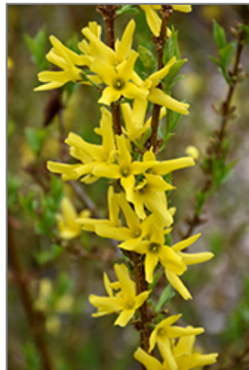
Bronx Forsythia flowers