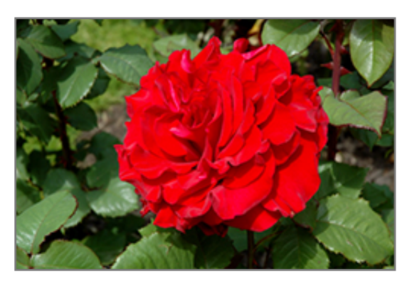
In The Mood Rose flowers