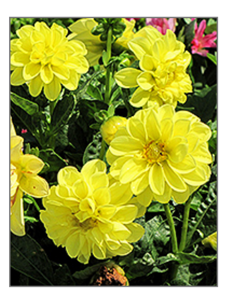
Dahlietta Julia Dahlia flowers

Dahlietta Julia Dahlia will grow to be about 8 inches tall at maturity, with a spread of 14 inches. The flower stalks can be weak and so it may require staking in exposed sites or excessively rich soils. Although it's not a true annual, this plant can be expected to behave as an annual in our climate if left outdoors over the winter, usually needing replacement the following year. As such, gardeners should take into consideration that it will perform differently than it would in its native habitat.