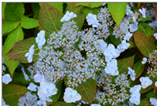
Tiny Tuff Stuff Hydrangea flowers

Tiny Tuff Stuff Hydrangea will grow to be about 24 inches tall at maturity, with a spread of 24 inches. It has a low canopy. It grows at a medium rate, and under ideal conditions can be expected to live for approximately 30 years.