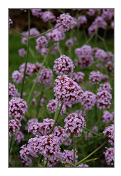
Meteor Shower Verbena flowers