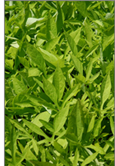
SolarPower Lime Sweet Potato Vine foliage

SolarPower Lime Sweet Potato Vine will grow to be about 12 inches tall at maturity, with a spread of 3 feet. Its foliage tends to remain dense right to the ground, not requiring facer plants in front. This fast-growing annual will normally live for one full growing season, needing replacement the following year.