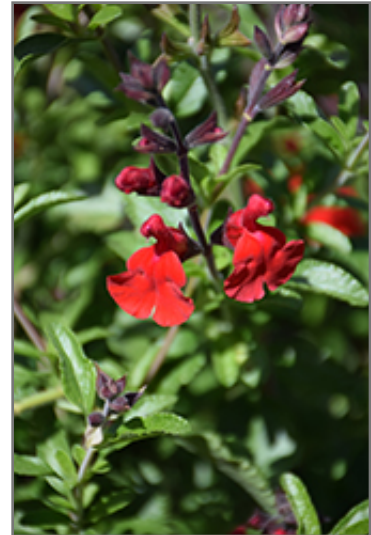
Radio Red Autumn Sage flowers