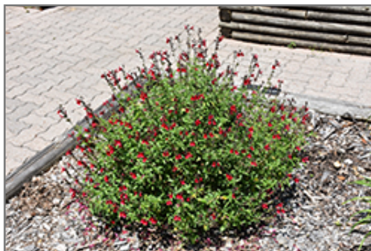
Radio Red Autumn Sage in bloom

Radio Red Autumn Sage will grow to be about 14 inches tall at maturity, with a spread of 16 inches. When grown in masses or used as a bedding plant, individual plants should be spaced approximately 12 inches apart. It grows at a medium rate, and under ideal conditions can be expected to live for approximately 5 years. As an evergreen perennial, this plant will typically keep its form and foliage year-round.