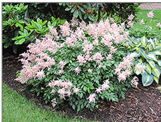
Peach Blossom Astilbe in bloom