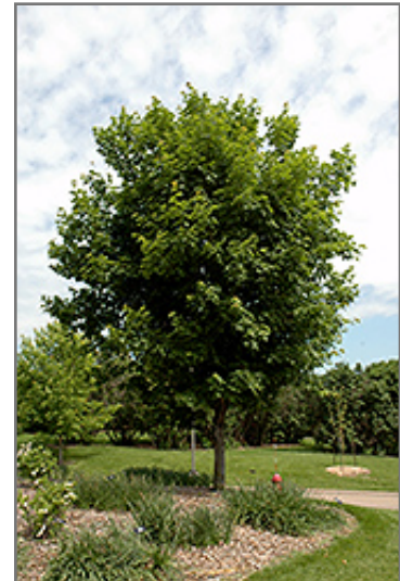
Sugar Maple

This tree should only be grown in full sunlight. It prefers to grow in average to moist conditions, and shouldn't be allowed to dry out. It is not particular as to soil pH, but grows best in rich soils. It is somewhat tolerant of urban pollution. This species is native to parts of North America.