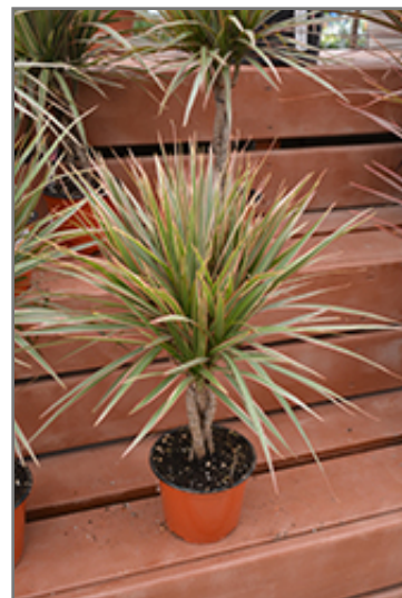
Colorama Dracaena in full

When grown indoors, Colorama Dracaena can be expected to grow to be about 3 feet tall at maturity, with a spread of 24 inches. It grows at a medium rate, and under ideal conditions can be expected to live for approximately 10 years. This houseplant performs well in both bright or indirect sunlight and strong artificial light, and can therefore be situated in almost any well-lit room or location. It does best in average to evenly moist soil, but will not tolerate standing water. The surface of the soil shouldn't be allowed to dry out completely, and so you should expect to water this plant once and possibly even twice each week. Be aware that your particular watering schedule may vary depending on its location in the room, the pot size, plant size and other conditions; if in doubt, ask one of our experts in the store for advice. It is not particular as to soil type or pH; an average potting soil should work just fine.