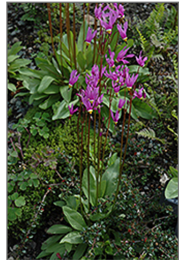
Shooting Star in bloom