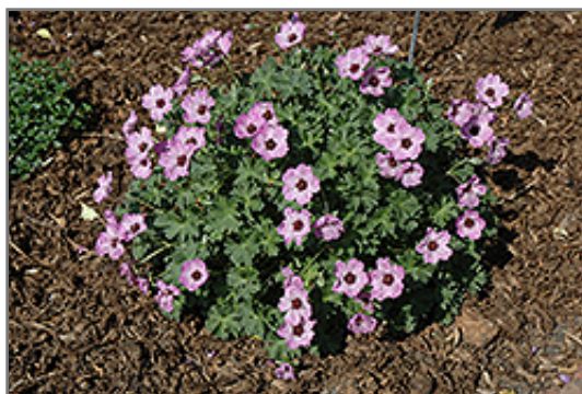
Ballerina Cranesbill flowers