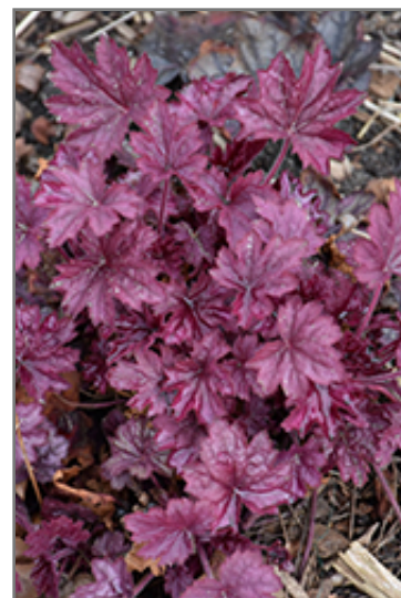
Wild Rose Coral Bells foliage