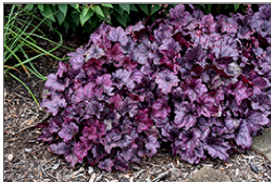
Wild Rose Coral Bells

Wild Rose Coral Bells is recommended for the following landscape applications;