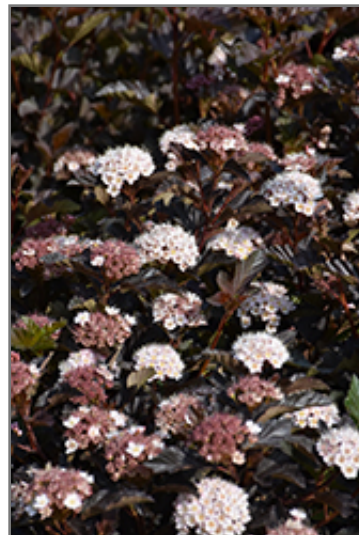
Petite Plum Ninebark flowers