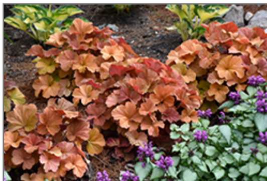
Northern Exposure Amber Coral Bells