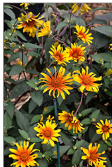
Burning Hearts False Sunflower flowers