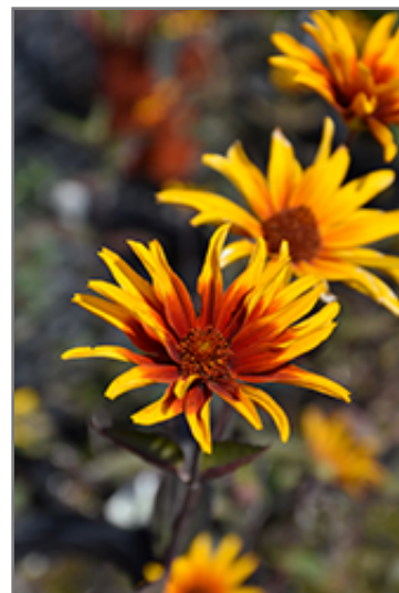
Burning Hearts False Sunflower flowers

Burning Hearts False Sunflower is an herbaceous perennial with an upright spreading habit of growth. Its medium texture blends into the garden, but can always be balanced by a couple of finer or coarser plants for an effective composition.