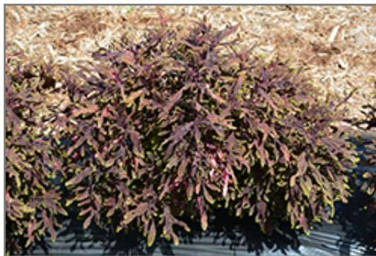
Under The Sea Lion Fish Coleus