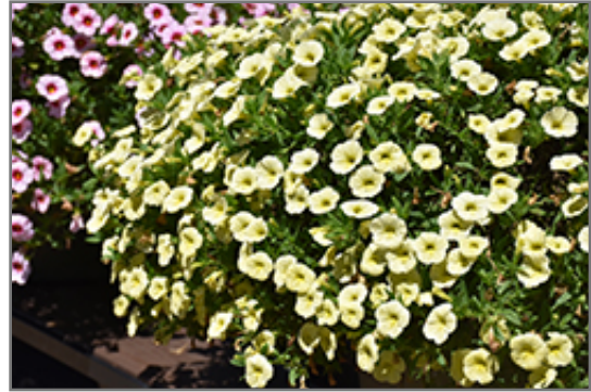
Cabaret Lemon Yellow Calibrachoa flowers

Cabaret Lemon Yellow Calibrachoa will grow to be about 10 inches tall at maturity, with a spread of 18 inches. When grown in masses or used as a bedding plant, individual plants should be spaced approximately 12 inches apart. Its foliage tends to remain low and dense right to the ground. This fast-growing annual will normally live for one full growing season, needing replacement the following year.