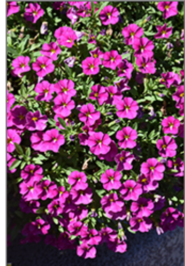
Cabaret Pink Star Calibrachoa flowers

Cabaret Pink Star Calibrachoa is recommended for the following landscape applications;