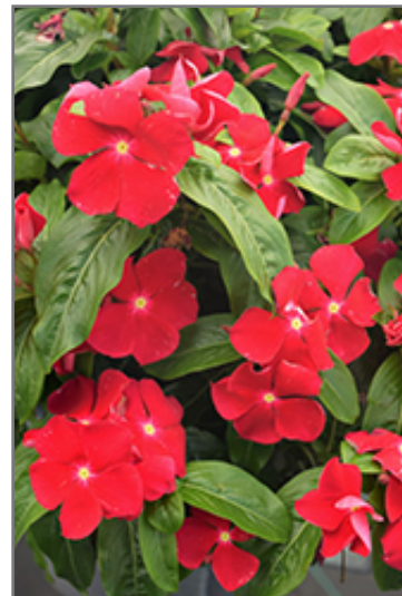
Titan Really Red Vinca flowers

Titan Really Red Vinca is recommended for the following landscape applications;