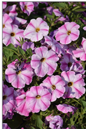
ColorRush Pink Star Petunia flowers