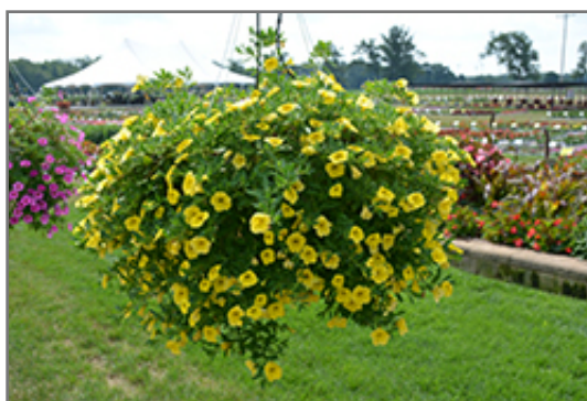
MiniFamous Neo Deep Yellow Calibrachoa in bloom