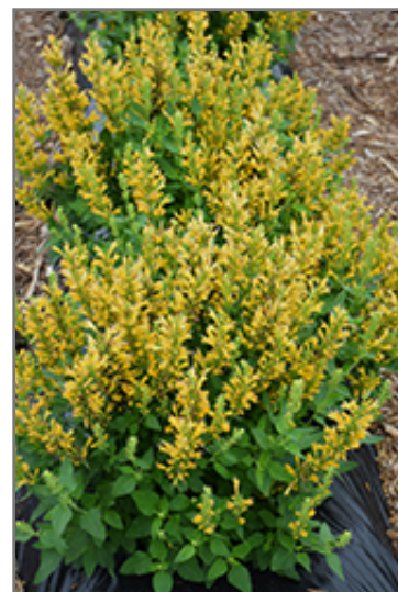
Poquito Butter Yellow Hyssop in bloom