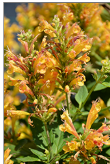
Poquito Butter Yellow Hyssop flowers