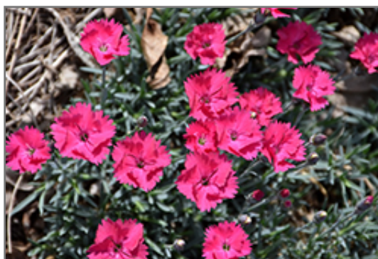
Paint The Town Magenta Pinks flowers