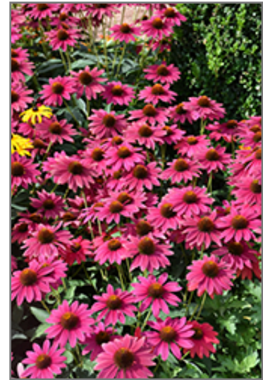
Sombrero Tres Amigos Coneflower flowers

Sombrero Tres Amigos Coneflower is a fine choice for the garden, but it is also a good selection for planting in outdoor pots and containers. With its upright habit of growth, it is best suited for use as a 'thriller' in the 'spiller-thriller-filler' container combination; plant it near the center of the pot, surrounded by smaller plants and those that spill over the edges. Note that when growing plants in outdoor containers and baskets, they may require more frequent waterings than they would in the yard or garden.