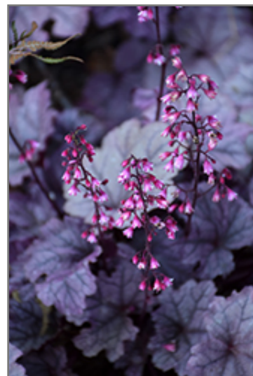
Pink Panther Coral Bells flowers

Pink Panther Coral Bells is a fine choice for the garden, but it is also a good selection for planting in outdoor pots and containers. With its upright habit of growth, it is best suited for use as a 'thriller' in the 'spiller-thriller-filler' container combination; plant it near the center of the pot, surrounded by smaller plants and those that spill over the edges. Note that when growing plants in outdoor containers and baskets, they may require more frequent waterings than they would in the yard or garden.