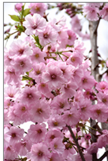
First Blush Flowering Cherry flowers