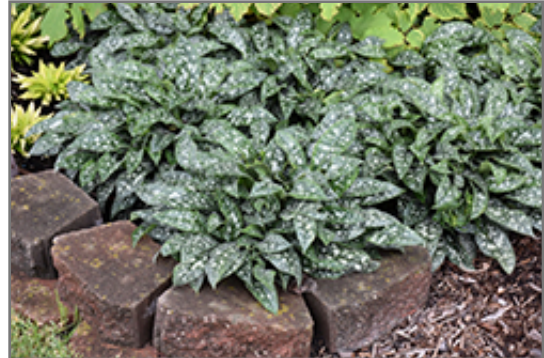
Twinkle Toes Lungwort

Twinkle Toes Lungwort will grow to be about 12 inches tall at maturity, with a spread of 18 inches. When grown in masses or used as a bedding plant, individual plants should be spaced approximately 15 inches apart. Its foliage tends to remain dense right to the ground, not requiring facer plants in front. It grows at a medium rate, and under ideal conditions can be expected to live for approximately 10 years. As an herbaceous perennial, this plant will usually die back to the crown each winter, and will regrow from the base each spring. Be careful not to disturb the crown in late winter when it may not be readily seen!