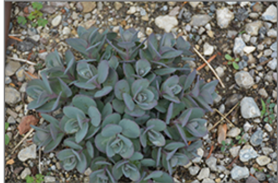
Rock 'N Grow Superstar Stonecrop

Rock 'N Grow Superstar Stonecrop is a fine choice for the garden, but it is also a good selection for planting in outdoor pots and containers. It is often used as a 'filler' in the 'spiller-thriller-filler' container combination, providing a mass of flowers and foliage against which the thriller plants stand out. Note that when growing plants in outdoor containers and baskets, they may require more frequent waterings than they would in the yard or garden.