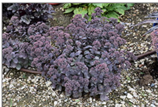
Rock 'N Grow Superstar Stonecrop in bloom