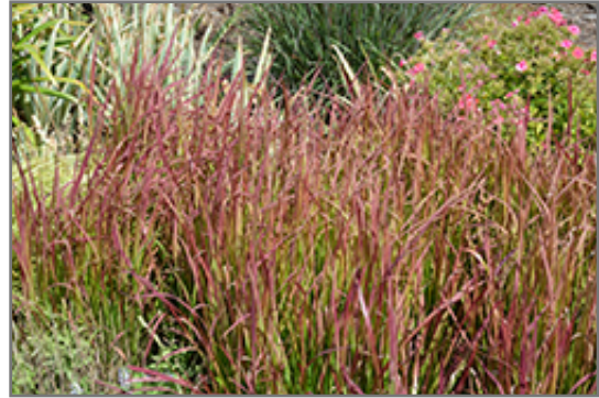
Red Baron Japanese Blood Grass

Red Baron Japanese Blood Grass will grow to be about 20 inches tall at maturity, with a spread of 18 inches. It grows at a slow rate, and under ideal conditions can be expected to live for approximately 20 years. As an herbaceous perennial, this plant will usually die back to the crown each winter, and will regrow from the base each spring. Be careful not to disturb the crown in late winter when it may not be readily seen!