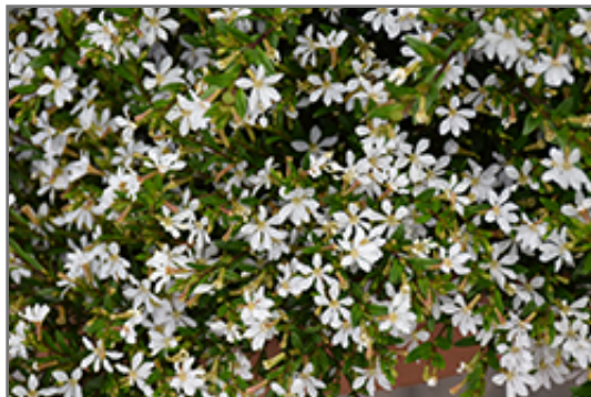
FloriGlory Maria Mexican Heather flowers