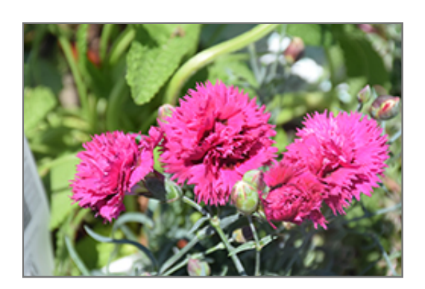
Fruit Punch Spiked Punch Pinks flowers