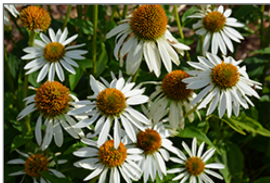
Happy Star Coneflower flowers

Happy Star Coneflower is recommended for the following landscape applications;