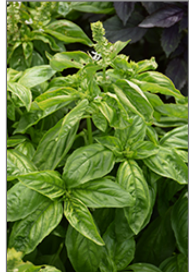
Genovese Basil foliage

This plant can be integrated into a landscape or flower garden by creative gardeners, but is usually grown in a designated herb garden. It should only be grown in full sunlight. It prefers to grow in average to moist conditions, and shouldn't be allowed to dry out. It is not particular as to soil type or pH. It is somewhat tolerant of urban pollution. This is a selected variety of a species not originally from North America. It can be propagated by cuttings; however, as a cultivated variety, be aware that it may be subject to certain restrictions or prohibitions on propagation.