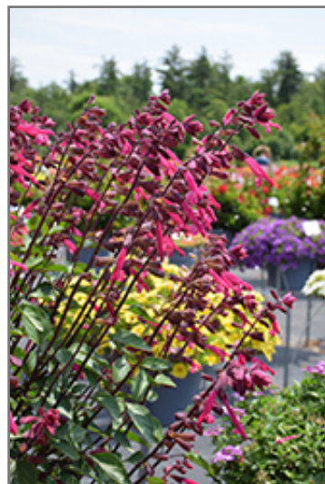
Skyscraper Dark Purple Salvia flowers

Skyscraper Dark Purple Salvia is an herbaceous annual with an upright spreading habit of growth. Its relatively fine texture sets it apart from other garden plants with less refined foliage.