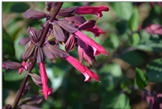
Skyscraper Dark Purple Salvia flowers

Skyscraper Dark Purple Salvia is a fine choice for the garden, but it is also a good selection for planting in outdoor pots and containers. With its upright habit of growth, it is best suited for use as a 'thriller' in the 'spiller-thriller-filler' container combination; plant it near the center of the pot, surrounded by smaller plants and those that spill over the edges. Note that when growing plants in outdoor containers and baskets, they may require more frequent waterings than they would in the yard or garden.