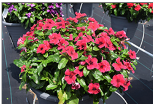
Tattoo Black Cherry Vinca in bloom