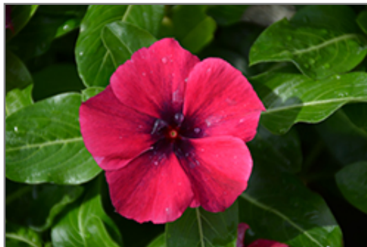
Tattoo Black Cherry Vinca flowers

Tattoo Black Cherry Vinca is recommended for the following landscape applications;