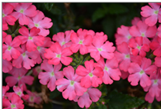
Firehouse Pink Verbena flowers