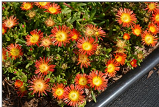
Delmara Red Ice Plant flowers

Delmara Red Ice Plant will grow to be only 4 inches tall at maturity extending to 6 inches tall with the flowers, with a spread of 15 inches. When grown in masses or used as a bedding plant, individual plants should be spaced approximately 12 inches apart. Its foliage tends to remain low and dense right to the ground. It grows at a fast rate, and under ideal conditions can be expected to live for approximately 5 years. As an evergreen perennial, this plant will typically keep its form and foliage year-round.