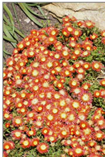
Delmara Red Ice Plant

Delmara Red Ice Plant is recommended for the following landscape applications;