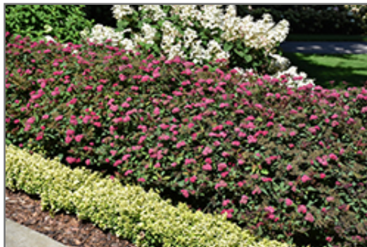
Double Play Doozie Spirea in bloom

Double Play Doozie Spirea is recommended for the following landscape applications;