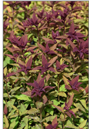
Double Play Doozie Spirea foliage

This shrub should only be grown in full sunlight. It prefers to grow in average to moist conditions, and shouldn't be allowed to dry out. It is not particular as to soil type or pH. It is highly tolerant of urban pollution and will even thrive in inner city environments. This particular variety is an interspecific hybrid.