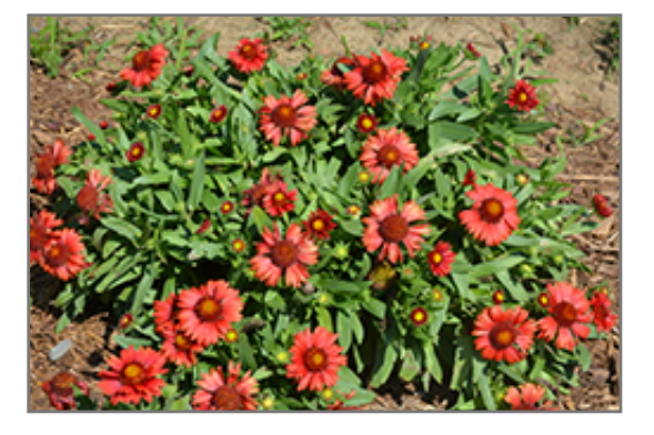
SpinTop Red Blanket Flower in bloom

5301 E. Terra Cotta Ave. Crystal Lake, IL. 60014 countrysideflowershop.com