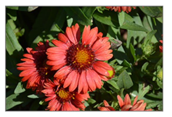
SpinTop Red Blanket Flower flowers