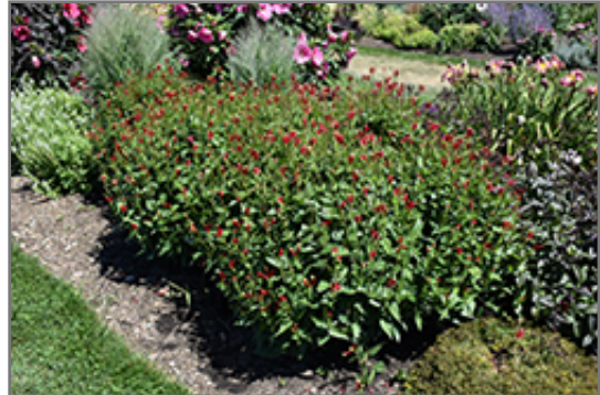
Little Redhead Indian Pink in bloom

Little Redhead Indian Pink is a fine choice for the garden, but it is also a good selection for planting in outdoor pots and containers. With its upright habit of growth, it is best suited for use as a 'thriller' in the 'spiller-thriller-filler' container combination; plant it near the center of the pot, surrounded by smaller plants and those that spill over the edges. Note that when growing plants in outdoor containers and baskets, they may require more frequent waterings than they would in the yard or garden.