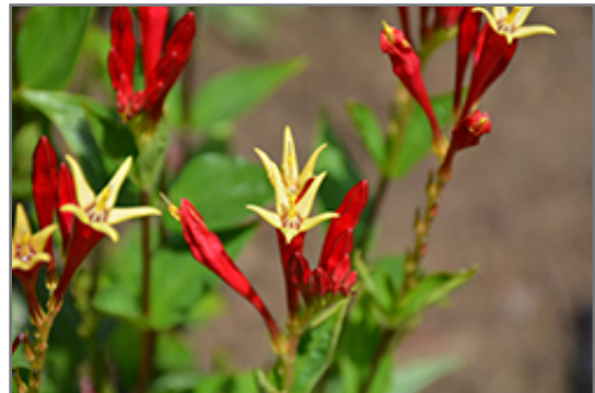
Little Redhead Indian Pink flowers