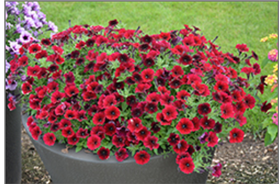
Supertunia Black Cherry Petunia in bloom

Supertunia Black Cherry Petunia is a fine choice for the garden, but it is also a good selection for planting in outdoor containers and hanging baskets. Because of its trailing habit of growth, it is ideally suited for use as a 'spiller' in the 'spiller-thriller-filler' container combination; plant it near the edges where it can spill gracefully over the pot. Note that when growing plants in outdoor containers and baskets, they may require more frequent waterings than they would in the yard or garden.