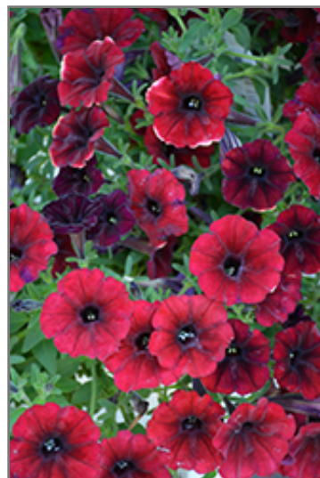
Supertunia Black Cherry Petunia flowers

This plant will require occasional maintenance and upkeep. Trim off the flower heads after they fade and die to encourage more blooms late into the season. It is a good choice for attracting butterflies and hummingbirds to your yard, but is not particularly attractive to deer who tend to leave it alone in favor of tastier treats. It has no significant negative characteristics.